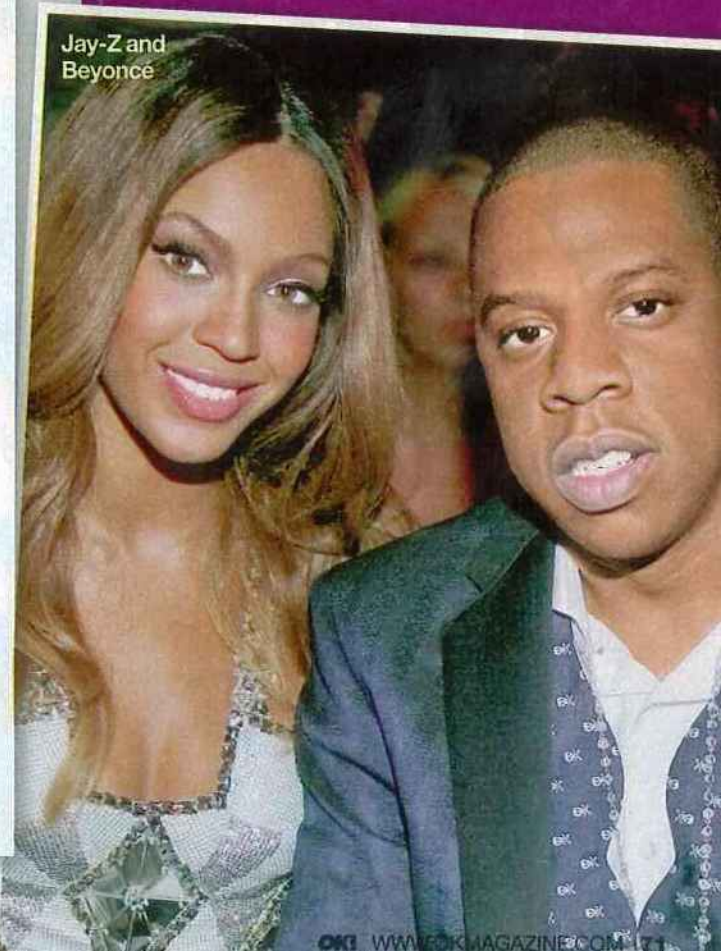
Jay-Z and Beyoncé

CLOCKWISE FROM RIHANNA: ALPHIA T. LANDOV; JESSE GRANT/GETTY IMAGES; FRANK MICELOTTA/GETTY IMAGES; ALL STILLS: LILLIAN POINS