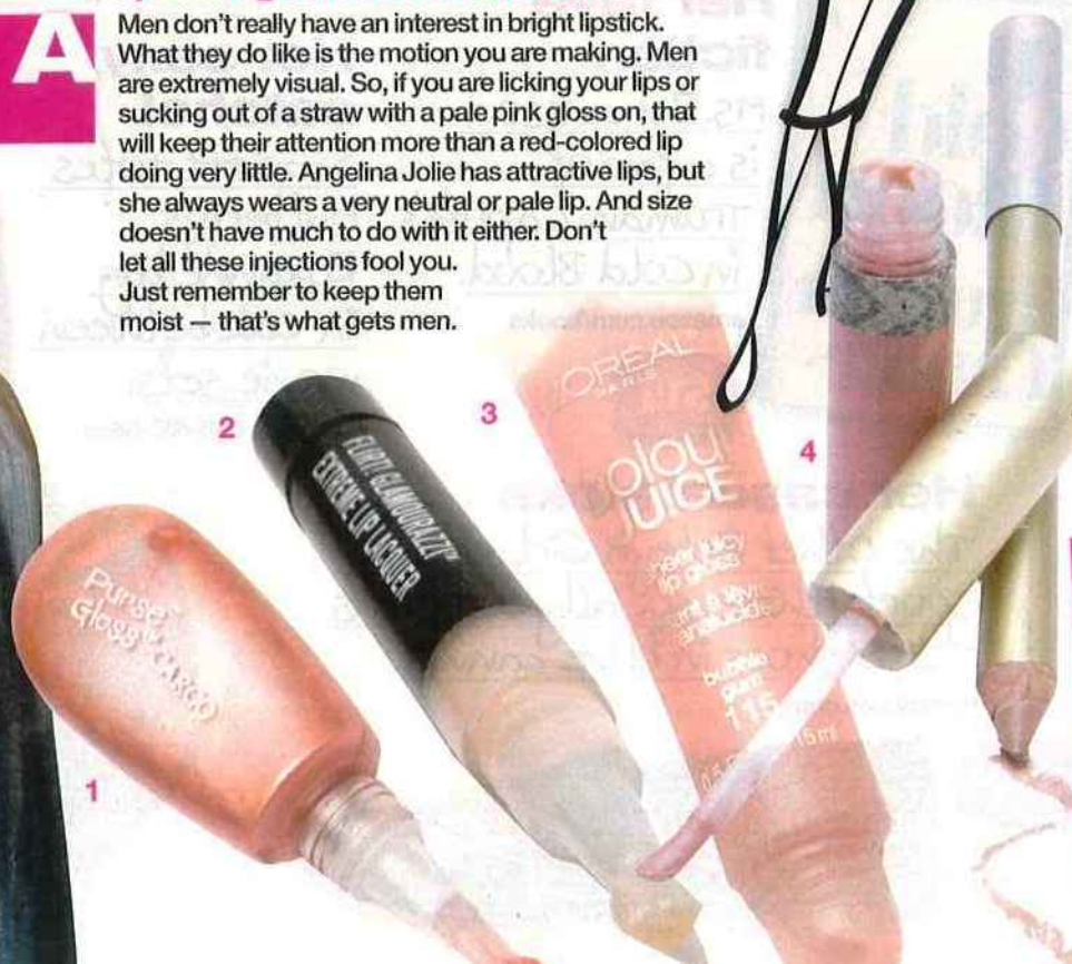
CLOCKWISE FROM JOLIE