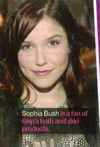
Sophia Bush is a fan of Gap's bath and skin products.